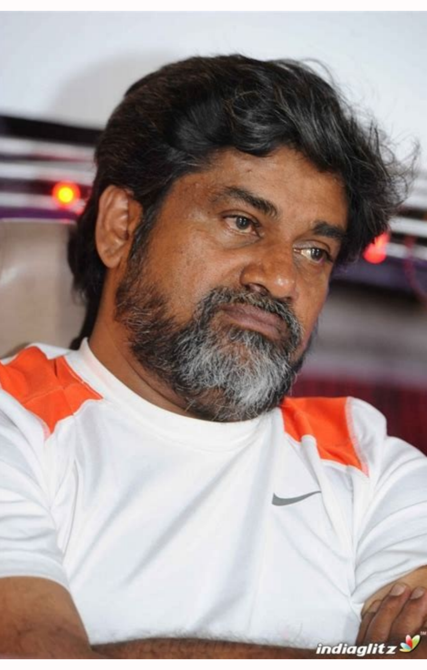
Panchatantra kannada film songs download. Panchatantra kannada film songs.